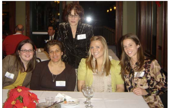
The staff of Crème della Crème brought lots of smiles and holiday cheer to the event.