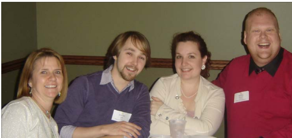
Staff members from the Merry-Go-Round Playhouse and the Finger Lakes Musical Theatre Festival share a laugh.