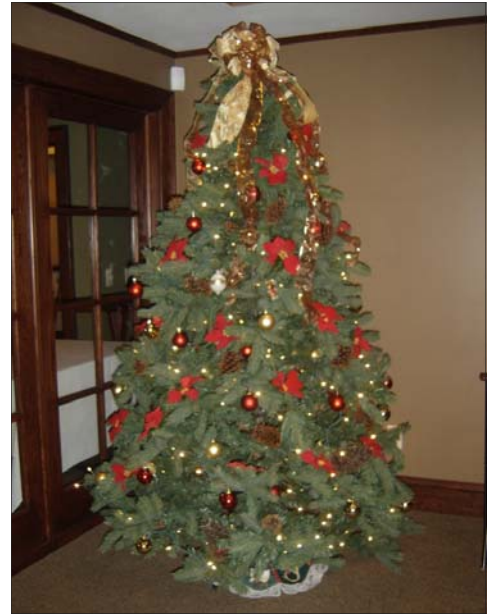
A beautiful holiday tree at Highland Park Golf Club.

On behalf of the staff at the Cayuga County Chamber of Commerce and the board of directors, we wish all of our members a safe and prosperous new year. Thank you again for supporting the chamber and for your efforts in making our region the very best place to work, eat, play and stay. We look forward to partnering with you again in the years to come.